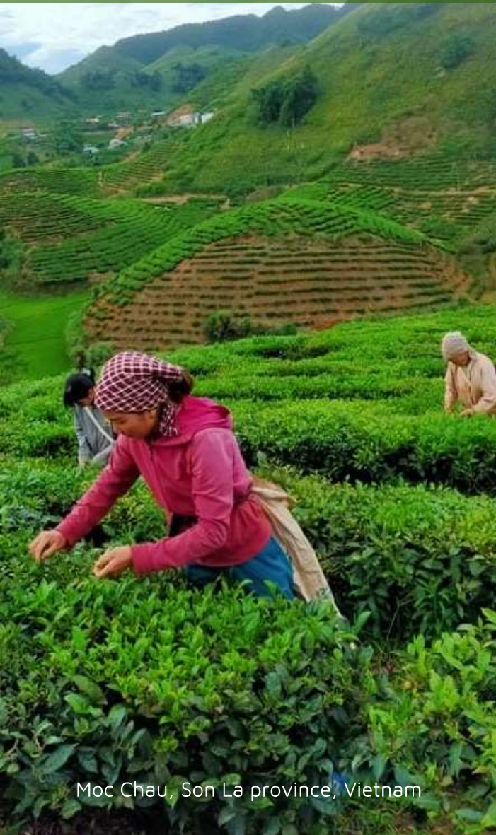
Moc Chau, Son La province, Vietnam